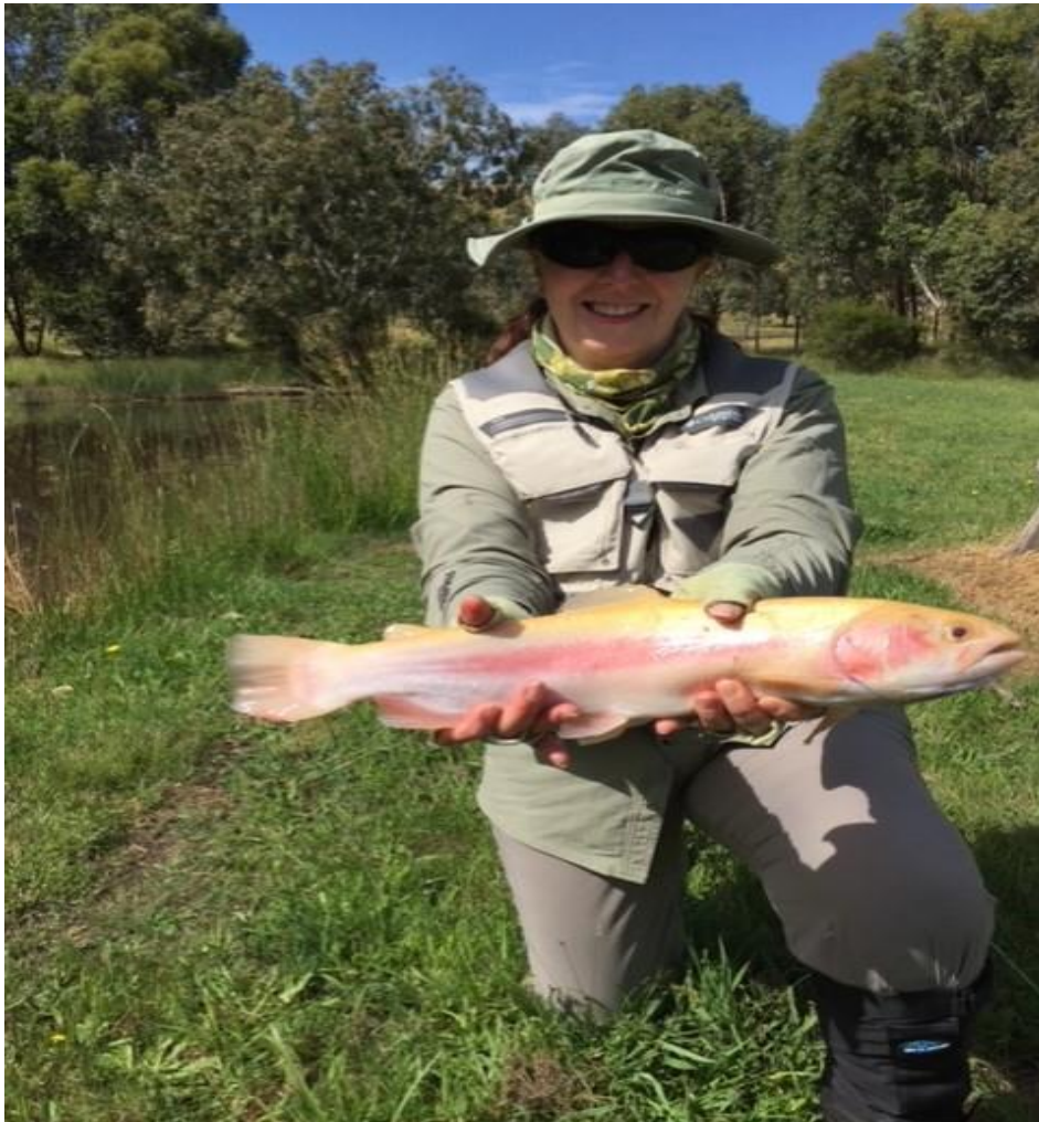
Merril's Golden Trout